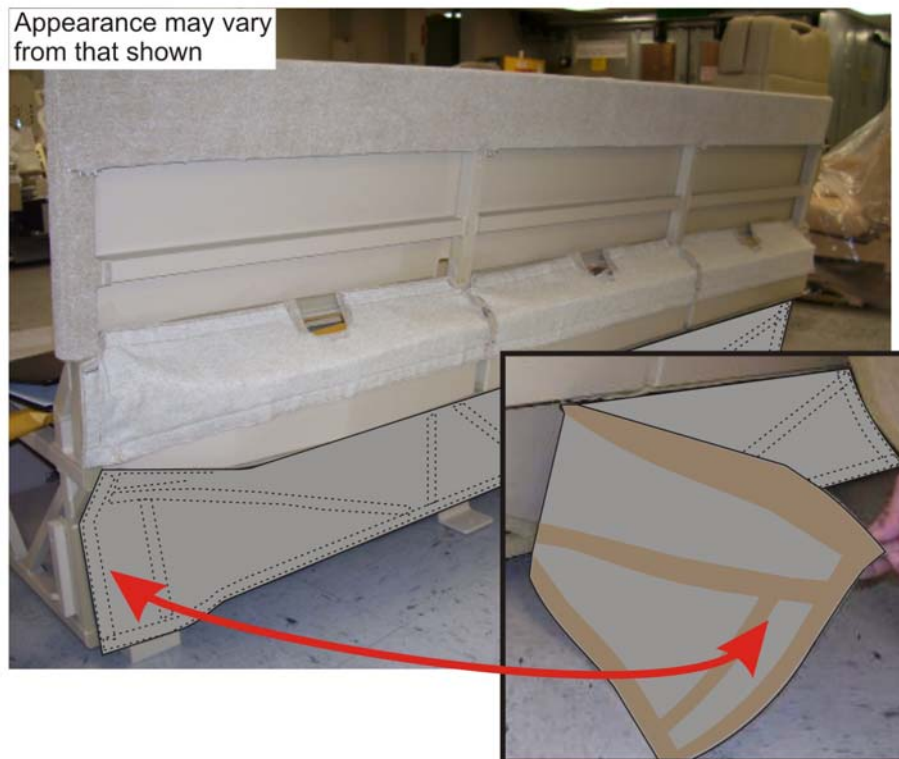
Figure 1: EXISTING DIVAN AIR CURTAIN